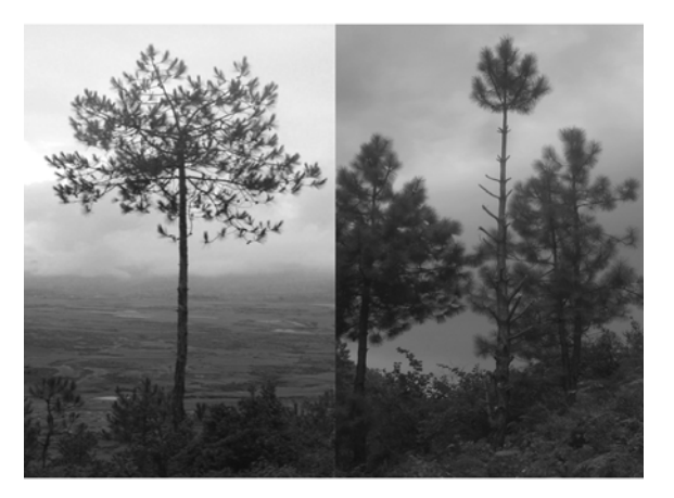
Figure 2 Pine trees with branches removed. Left: Thirty-two year old Pinus yunnanensis tree with branches completely removed from 15 whorls and another 2 whorls with partial cutting (photo by Tom Hinckley, July 4, 2002). Right: Twenty-two year old P. yunnanensis tree with branches completely removed from 15 whorls, 3 whorls (top) with live branches; branch stubs and scars indicate location of harvested whorls (photo by Keala Hagmann, August 26, 2008).

the villages had extensive cutting of their branches (Figure 2) for fodder and protection of mud walls from rain damage and (2) stands more remote in elevation from villages showed less evidence of human-related activities and had greater standing biomasses.